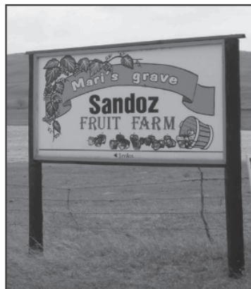
This sign marks the turn off from Highway 27 30 miles south of Gordon.