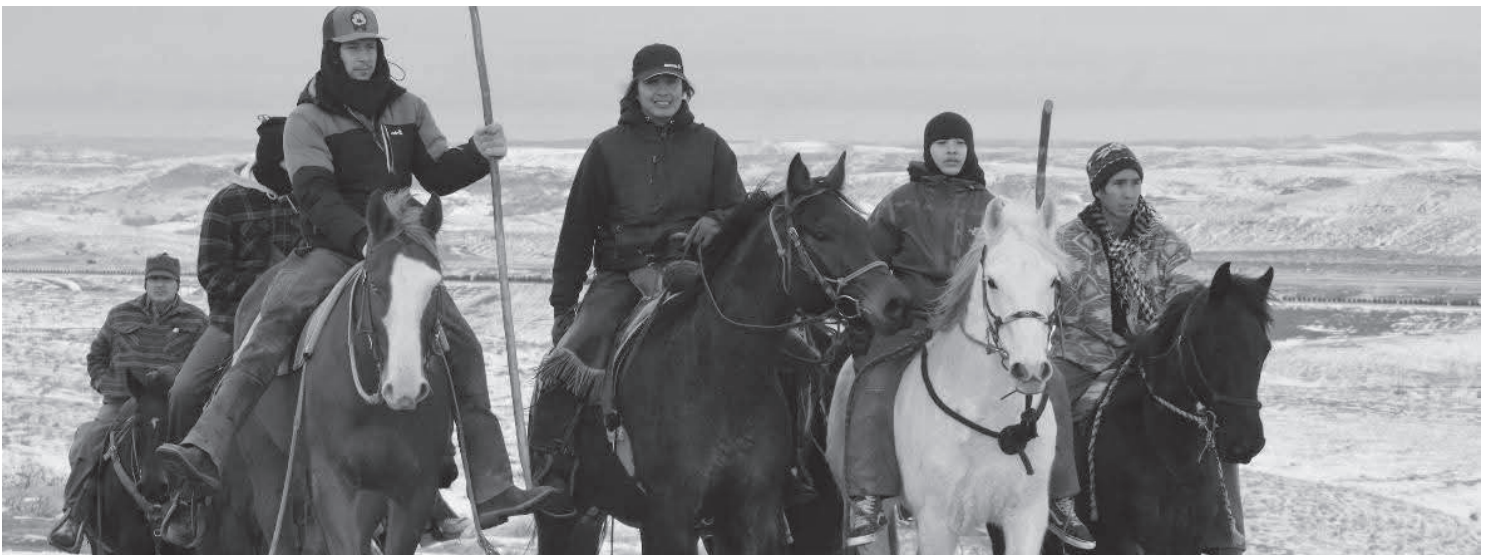
Youth riders arriving at the battlefield