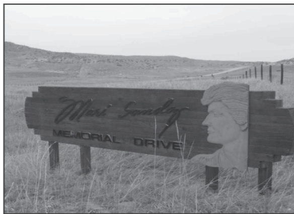
The Mari Sandoz Memorial Drive leads to Mari's grave and the remnants of the Sandoz orchards described in her books.